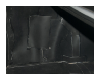
2012 Toyota Prius Plugin