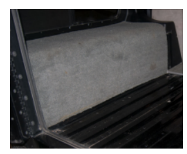
Honda Civic Sedan