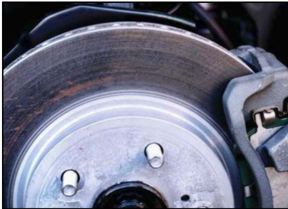
Figure 1. Slight rust on rotor (easy to remove by braking)