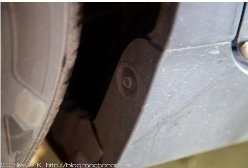
10 mm at the back of the side rocker

Use a 10 mm socket to remove two 10 mm bolts from the back and underneath the back of the side rocker.