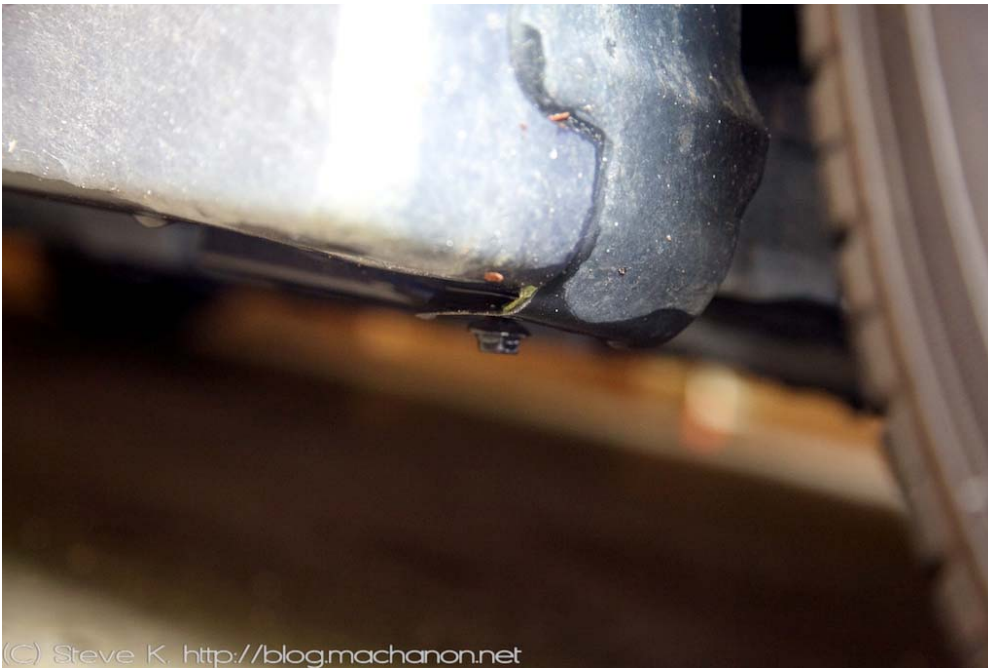
10 mm underneath front of side rocker