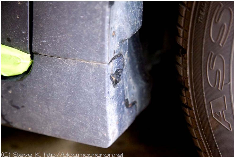
10 mm bolt at front of side rocker

Use a 10 mm socket to remove two 10 mm bolts from the front and underneath the front of the side rocker.