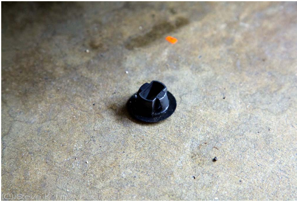
Plastic plugs x4

Then remove 4 large push pins. Save these large push pins for later re-installation.