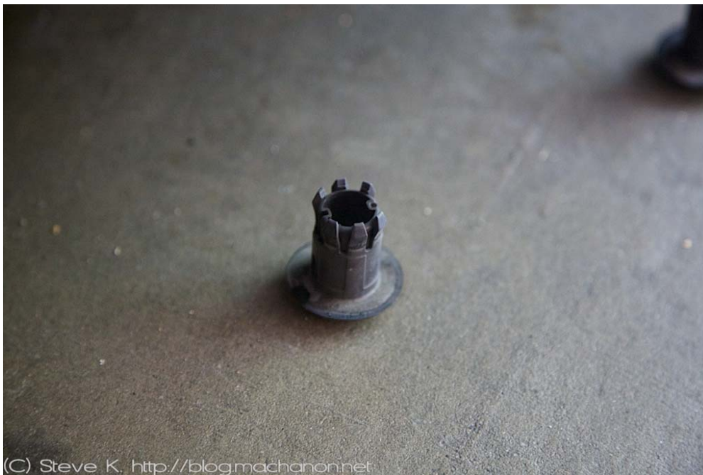
Large push pins x4

Then remove 4 large push pins. Save these large push pins for later re-installation.