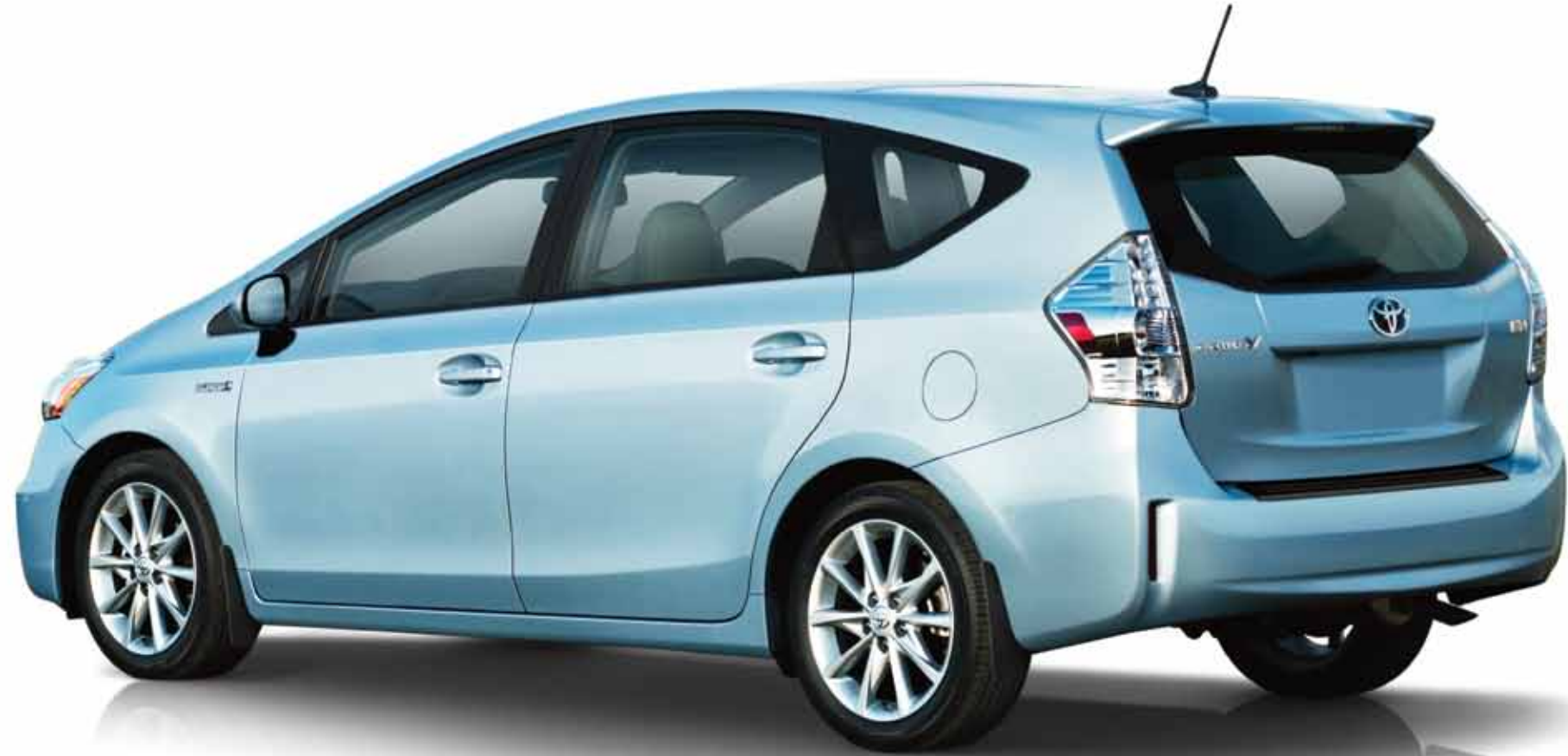
The innovative Prius v with Touring Package shown in Clear Sky Metallic.

The 2012 Prius v offers all of the proven benefits of Prius, plus a remarkable amount of added functionality. Its rear cargo area is not only 50% larger than Prius, but also loaded with versatile features nearly everywhere you look. And Prius v delivers the highest fuel efficiency of any sport or crossover utility vehicle with a combined city highway rating of 4.6 L/100 km 2 . Considering all of the benefits that Prius v has in store, it looks like the future is shaping up nicely. More Prius, more possibilities.