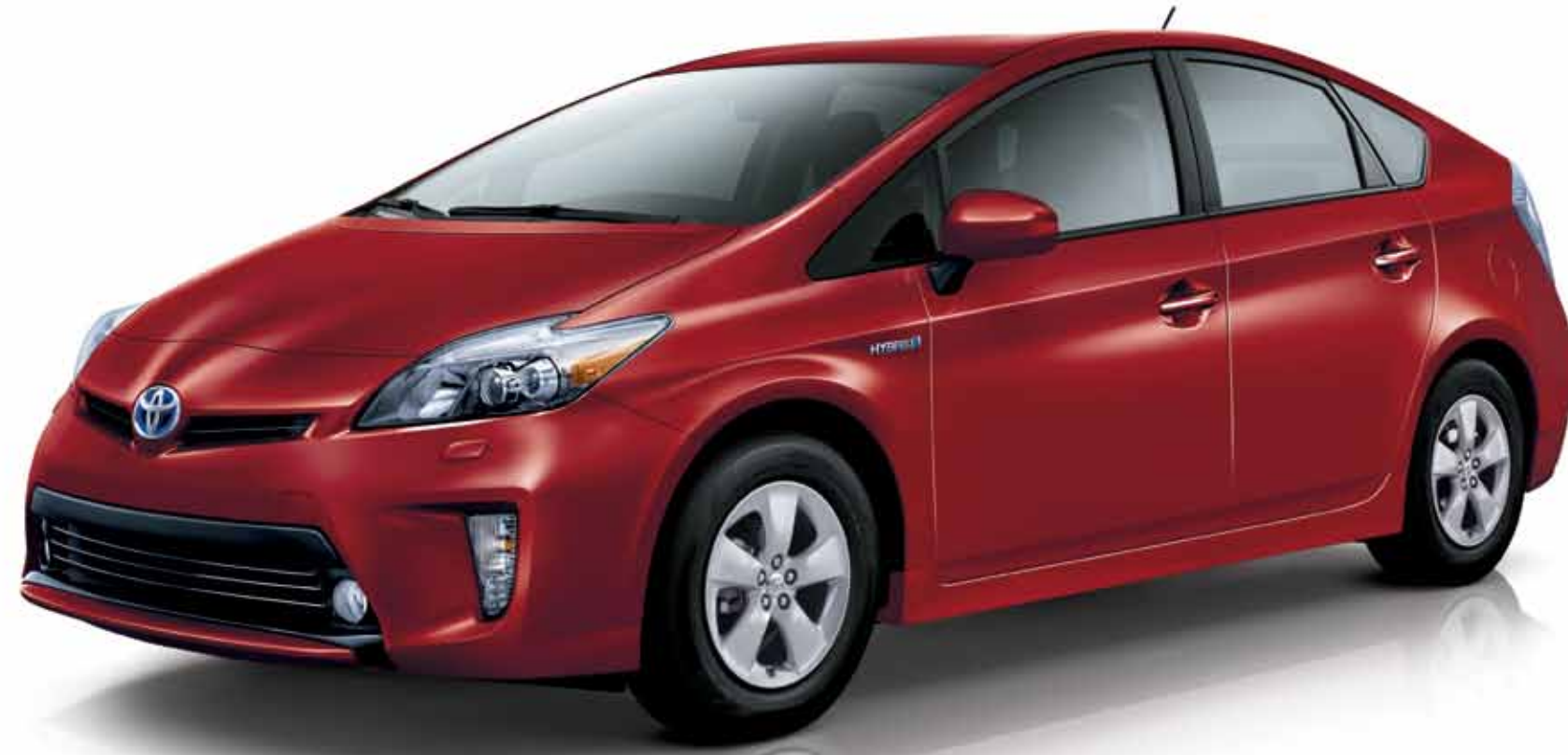
Prius with Touring Package shown in Barcelona Red Metallic.

Toyota's iconic hybrid, the restyled 2012 Prius has shown that there can be consensus among many different types of drivers. Those who demand fuel efficiency, and those who need to get from point A to B quickly. Those intrigued by highly advanced technology, and those who insist on proven reliability. Those interested in reducing their carbon footprint, and those who are hesitant to sacrifice practicality in order to do it. With all that Prius has to offer, it may well be the one form of transportation that we can all agree upon.