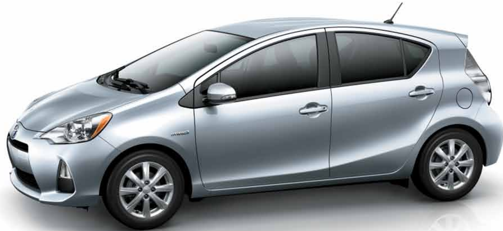
Prius c Technology shown in Classic Silver Metallic.

Meet the all new 2012 Toyota Prius c, the smallest member of the Prius Family and the most affordable Prius ever. With a combined city/highway fuel consumption rating of 3.7 L/100 km 2 , it is the highest rated fuel-efficient vehicle in Canada without a plug. Prius c's spacious and versatile interior, premium list of standard features and clever city-friendly size make it the perfect fun to drive car through any urban landscape.