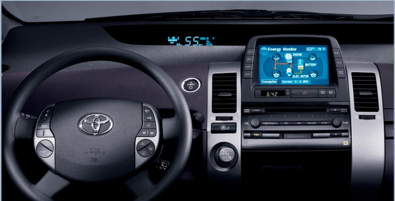
Prius interior features steering wheel-mounted controls and a multi-information screen