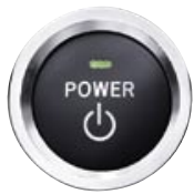
Power on/off button.