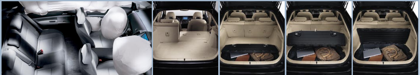
Driver and front passenger dual-stage airbags 1 and available front seat-mounted side and front and rear side curtain airbags. 1