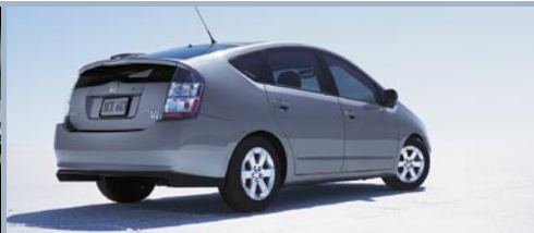
Prius shown in Tideland Pearl