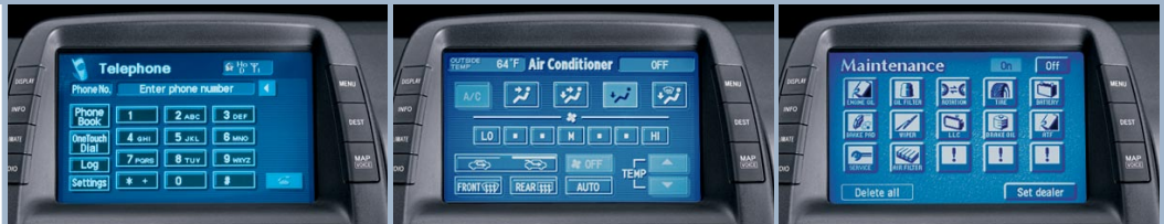
Multi-information display with hands-free phone screen with Bluetooth™ technology/air conditioning/maintenance screen.