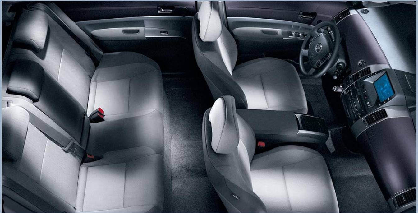
Prius interior shown in Gray/Burgundy with available Package #6