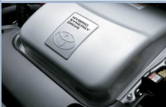
Prius' Hybrid Synergy Drive® system.