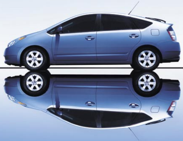
Prius shown in Seaside Pearl