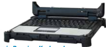
Panasonic Premium Keyboard