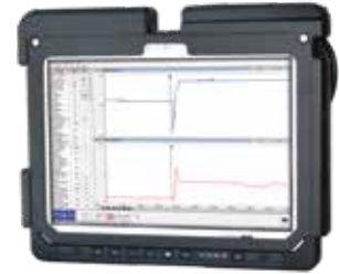
CF-33 & Techstream ADVi Software and Snap-on® Boot