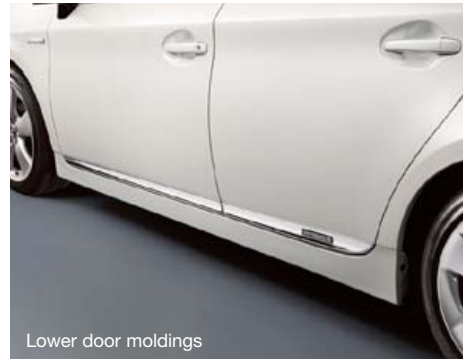
Lower door moldings