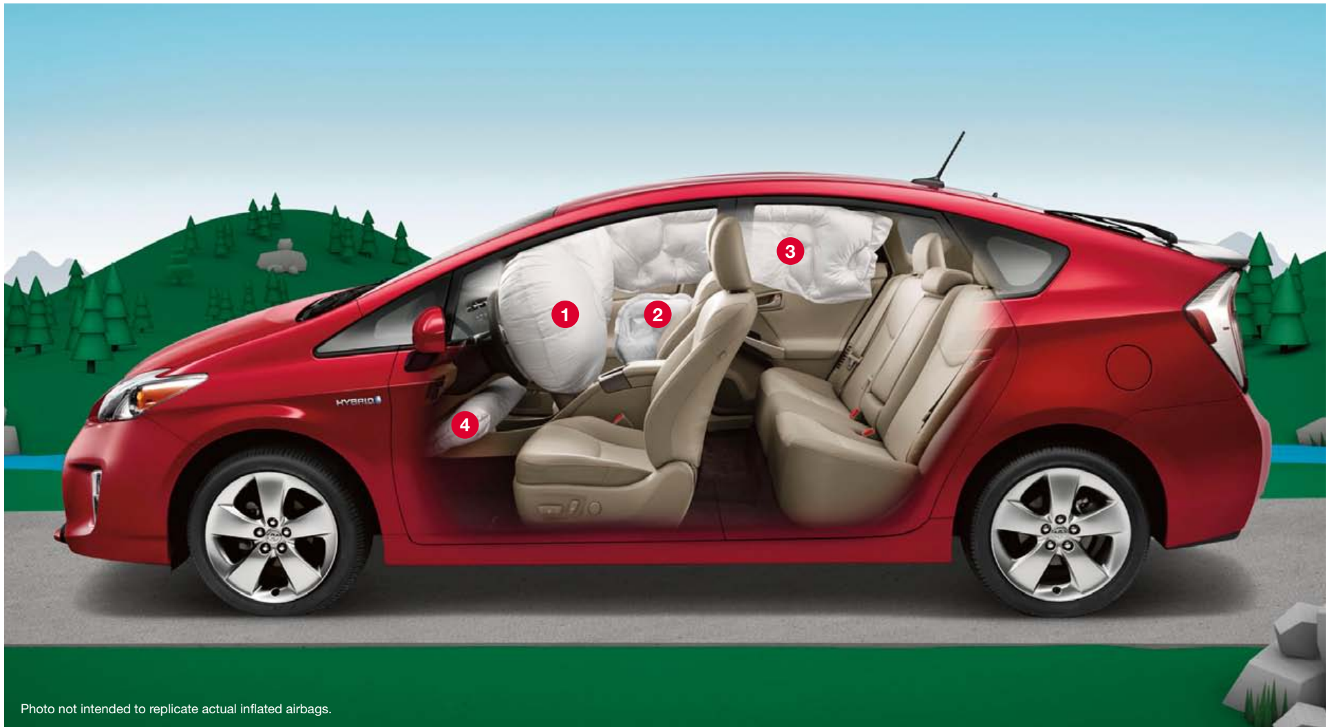
Photo not intended to replicate actual inflated airbags.

This airbag does more than its name suggests. In the event of a frontal collision, it can also help reduce the force on the chest and abdomen.