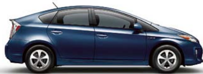
NAUTICAL BLUE METALLIC