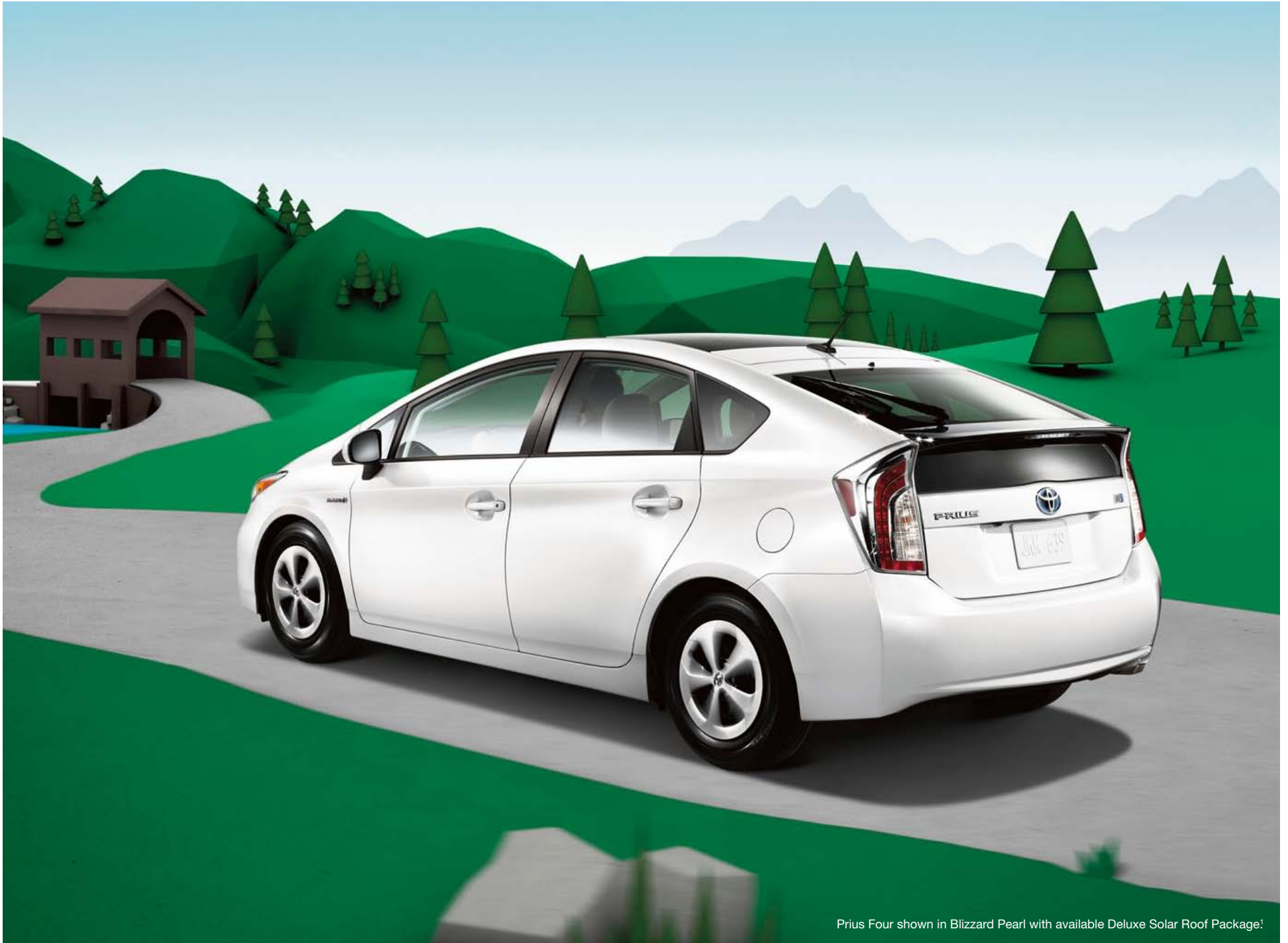
Prius Four shown in Blizzard Pearl with available Deluxe Solar Roof Package!