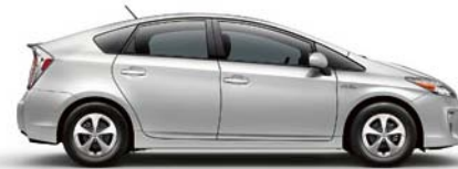
CLASSIC SILVER METALLIC