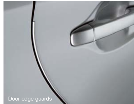
Door edge guards