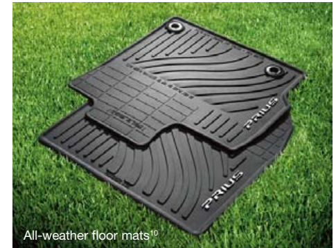
All-weather floor mats 10