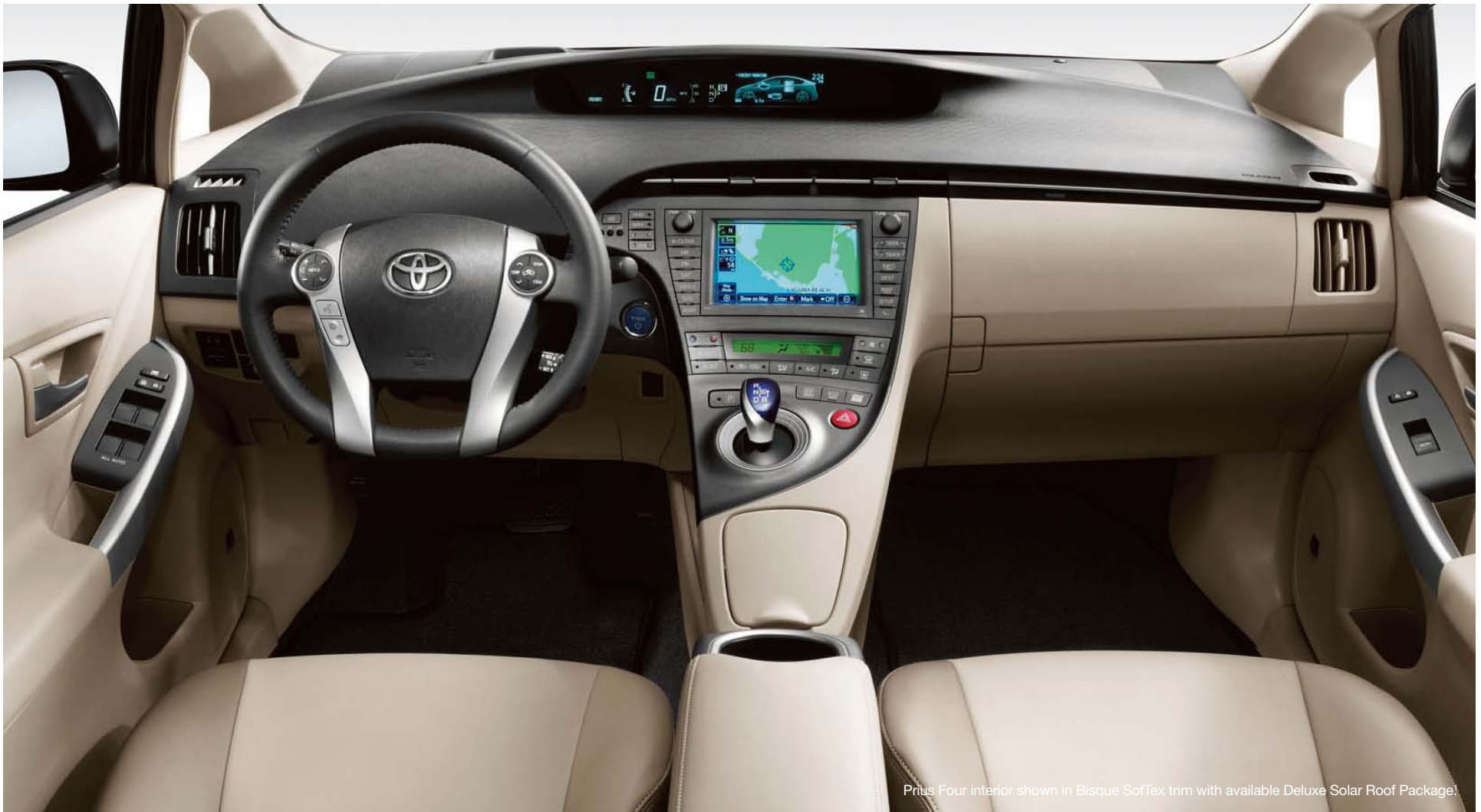
Prius Four interior shown in Bisque SofTex trim with available Deluxe Solar Roof Package!

1. See footnote 2 in Disclaimers section.