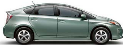
SEA GLASS PEARL