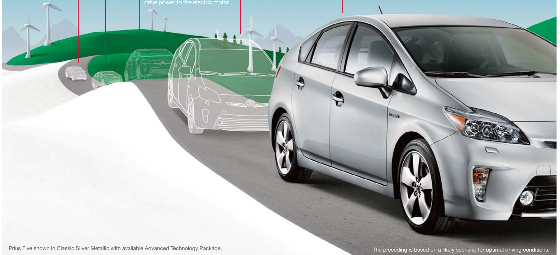
Prius Five shown in Classic Silver Metallic with available Advanced Technology Package.

GASOLINE ENGINE The series-parallel Hybrid Synergy Drive® helps the gasoline engine deliver both power and fuel efficiency.