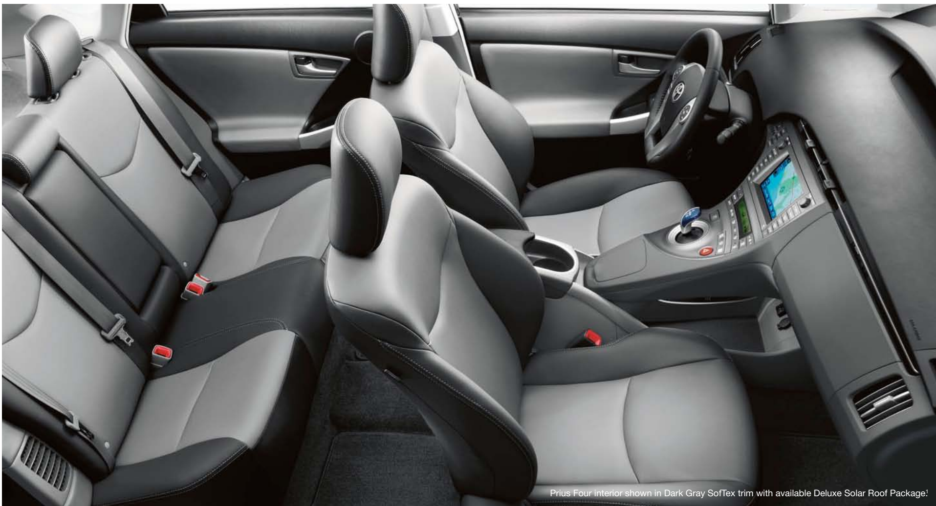
Prius Four Interior shown in Dark Gray SofTex trim with available Deluxe Solar Roof Package!

Getting comfortable is easy, thanks to the available 8-way power-adjustable driver's seat with power lumbar support that lets you find your ideal position.