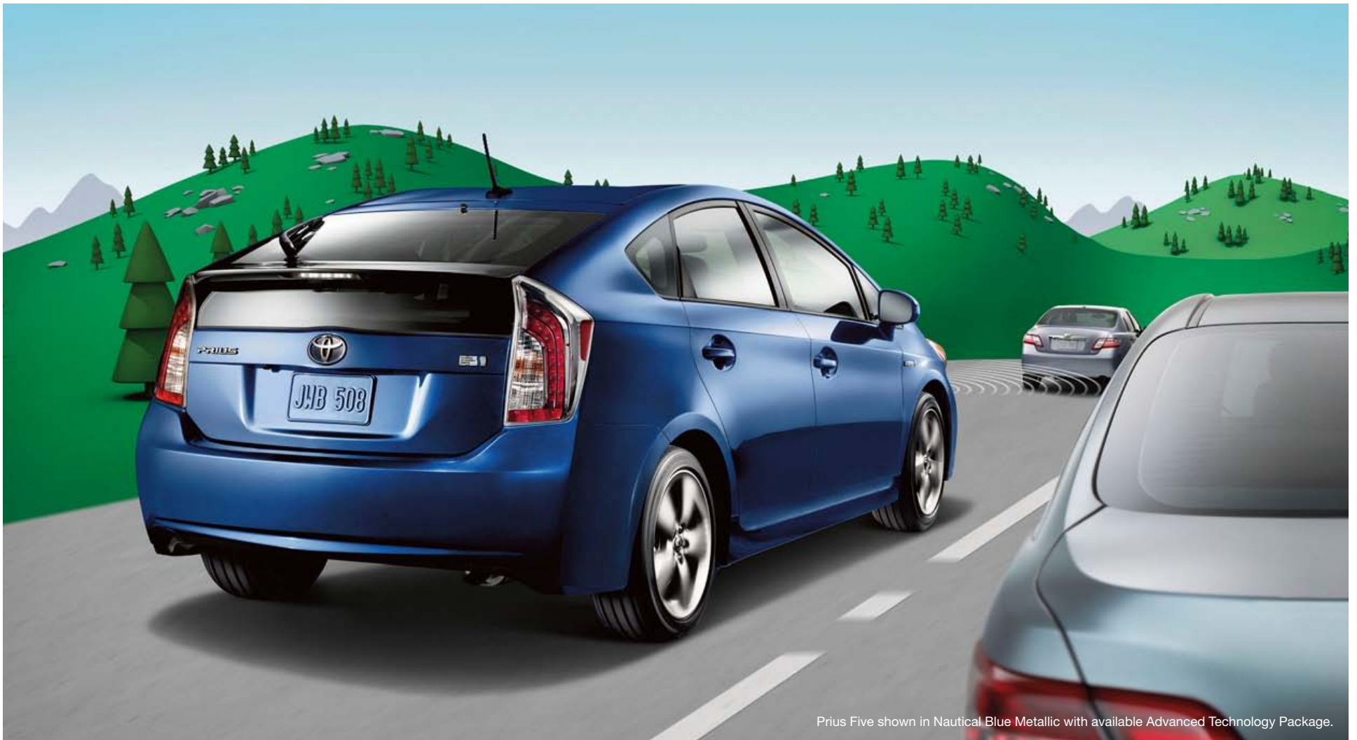
Prius Five shown in Nautical Blue Metallic with available Advanced Technology Package.