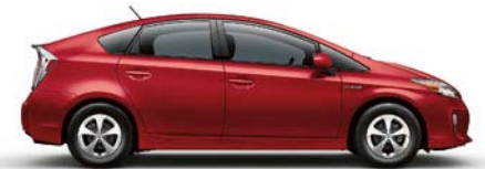
BARCELONA RED METALLIC