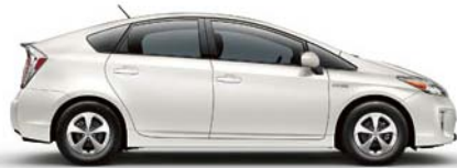
BLIZZARD PEARL (extra-cost color)