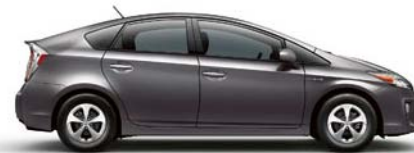
WINTER GRAY METALLIC