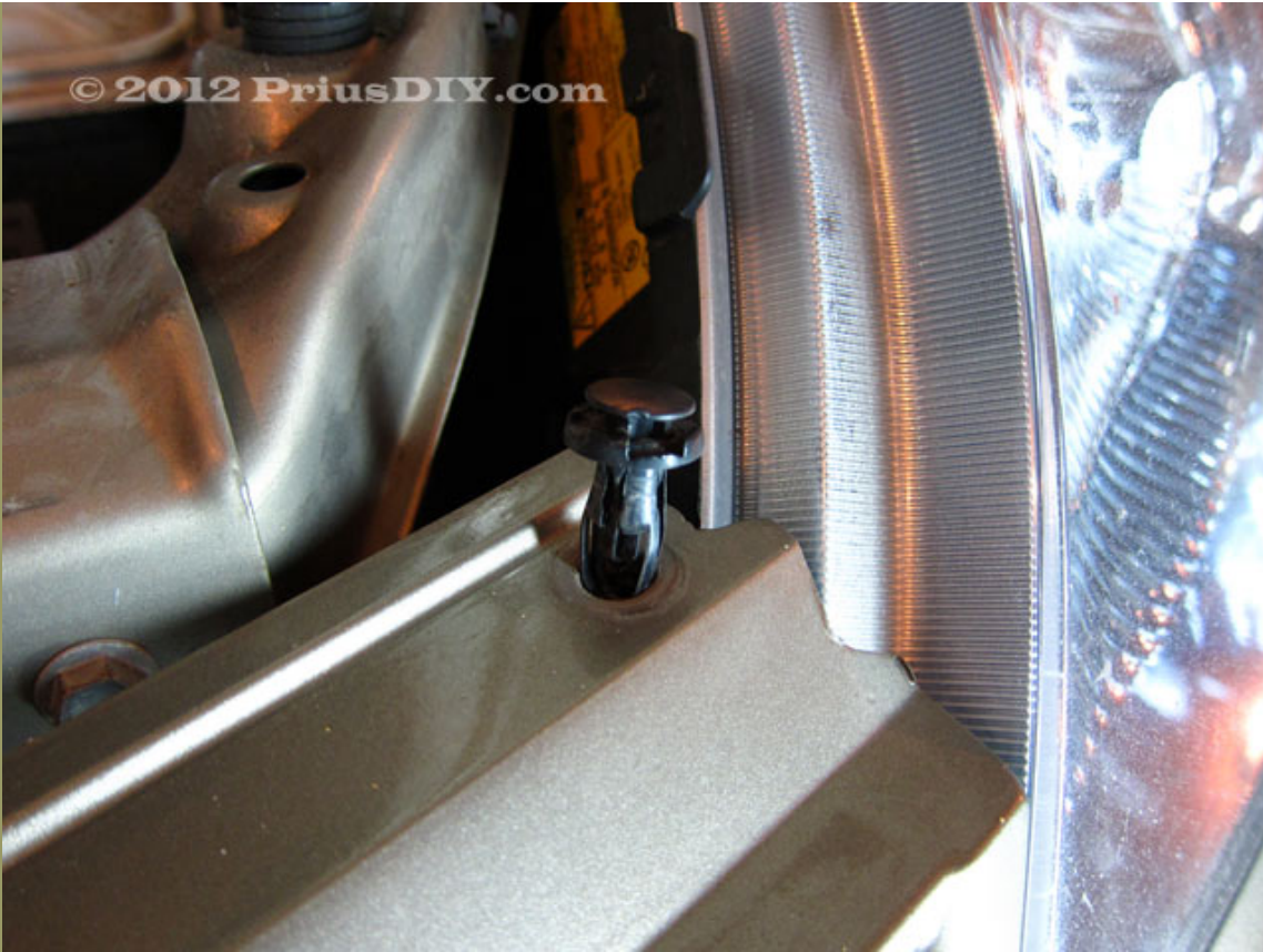
2b) ...and pull out.