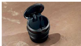
Ashtray Cup $17 Parts Only MSRP**