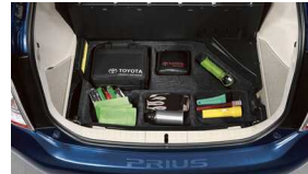
Cargo Organizer $49 Installed MSRP*