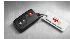
Remote engine start $529 Installed MSRP*