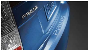
Rear bumper applique $69 Installed MSRP*