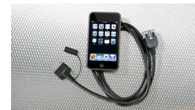
iPod Interface $299 Installed MSRP*