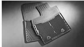
All-weather Floor/Cargo Mats - 5pc Set $199 Installed MSRP*