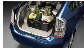
Cargo tote by Nifty Products $40 Installed MSRP*