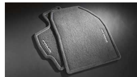
Carpet Floor Mats & Cargo Mat $200 Installed MSRP*