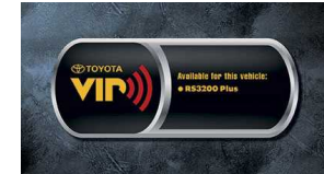
VIP RS3200Plus Security System $359 Installed MSRP*