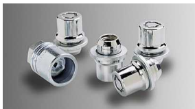
Wheel locks (alloy) $67 Installed MSRP*