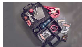
Emergency assistance kit $70 Installed MSRP*