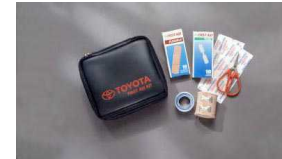
First aid kit $29 Installed MSRP*