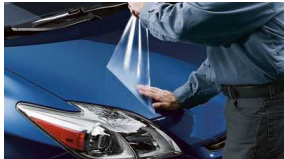
Paint protection film $395 Installed MSRP*