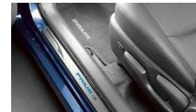
Illuminated door sill $359 Installed MSRP*